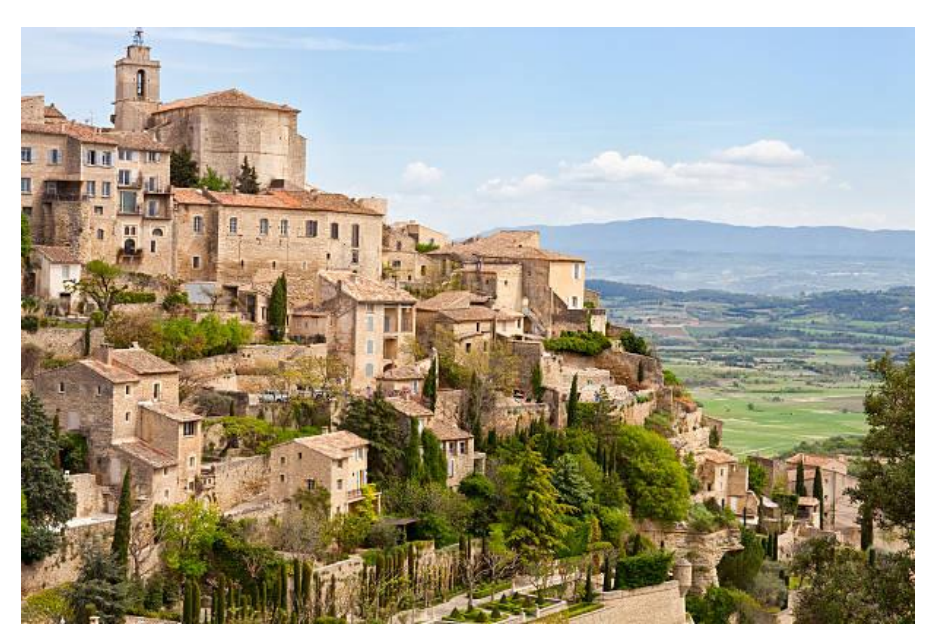
Village in central Provence