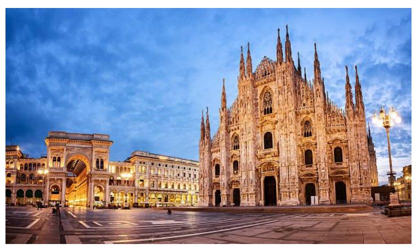
Duomo in Milan

Morning tour of Milan with a visit to the Duomo and hopefully to see the last Super fresco of Da Vinci. Time allowing and if possible, visit the Scala opera house before some time at leisure and concert venue. Dinner and overnight in Milan