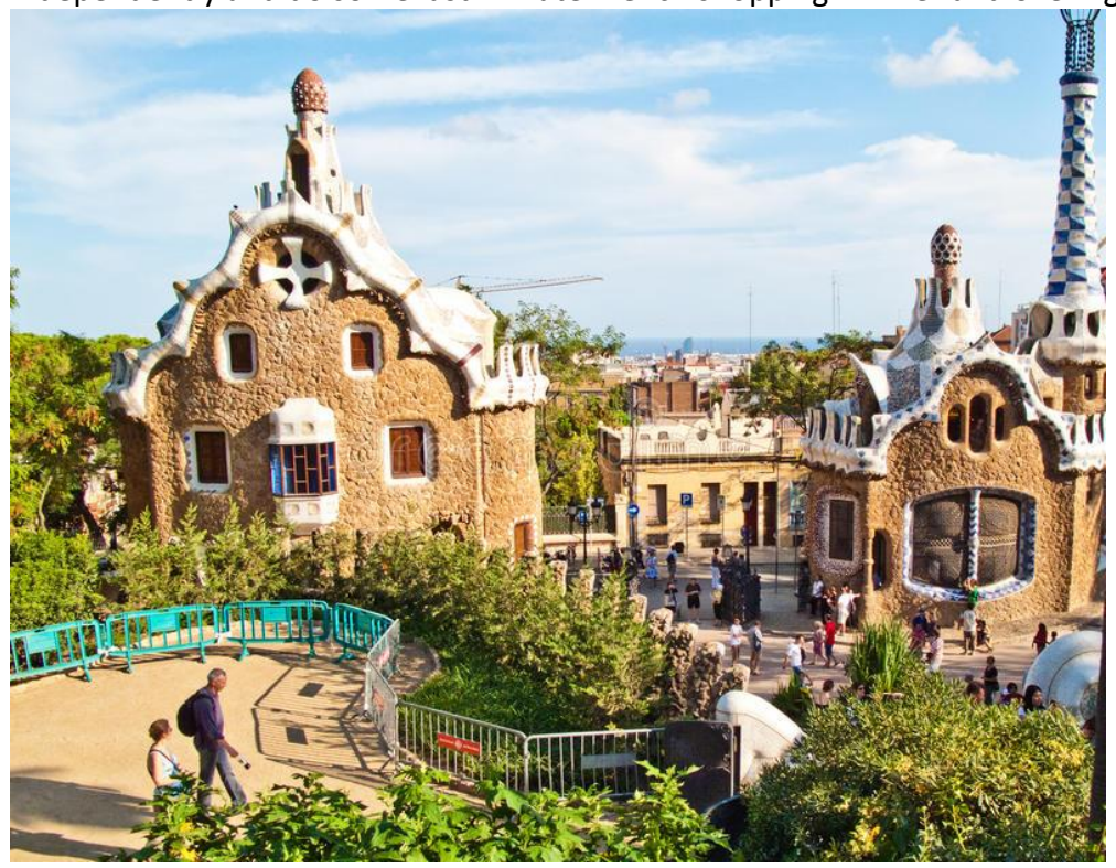
One of Gaudi's architectural master pieces

History continues to follow you as you visit the Impressive Papal Palace. Avignon was the home of the Popes for 70 years when religious wars raged in Italy. The city is located on the river Rhone which is one of the longest rivers in Europe. One of its bridges only spans half way over the river and there is a famous song singing about it. Perhaps you have heard of it!! We will arrange a concert venue in this lovely ancient town where you will also have time to enjoy the sites independently and do some last-minute French shopping. Dinner and overnight in Avignon.